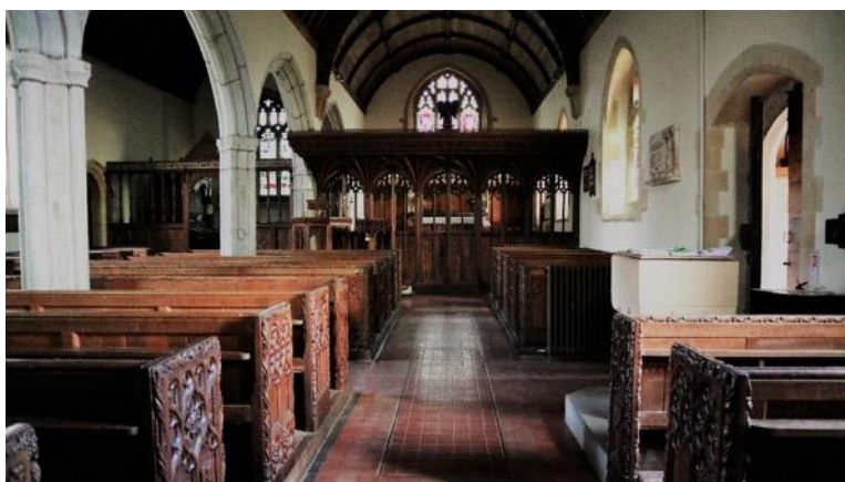
Our church was sympathetically restored in the late 1800s, and again in 2001.

Regarding the main challenges facing our PCC, we feel that the greatest problem is that of overbearing church-bureaucracy. This weighs down upon vicars, dragging them away from the pastoral work that is key to reviving interest in, and support for, our local church. We strongly believe that unless our Clergy have the time to visit people and be active in the community, we will continue to lose visibility and support for what we do.