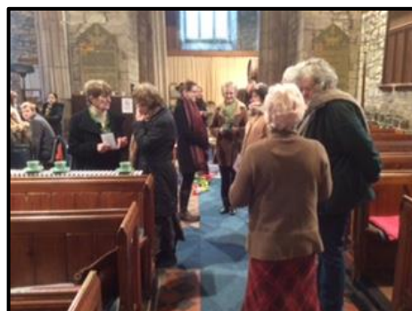
After service Fellowship