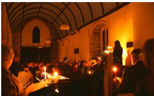
High Bray – Christmas Eve

We welcome the opportunity, in partnership with our Vicar, to increase further the creative presence of All Saints in the activities of our village, to re-establish the support of the Church for those in need, and to further the mission of the Church as a public witness of our faith.