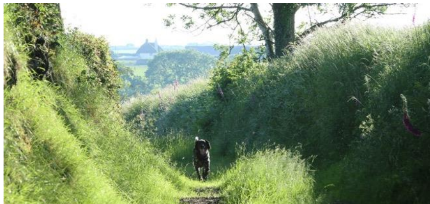
One of the many footpaths and bridleways through unspoilt grazing-land surrounding Rose Ash.

Local roots are still quite strong in Rose Ash, and many people visit the churchyard to pay their respects and tend to the graves of relatives. But this does not often translate into direct support for the work of the church – or indeed the maintenance of its fabric. Thus, although the PCC is a close-knit team that manages to keep things “on the road”, they face the all-too common struggle against a growing apathy to religion in the wider community.