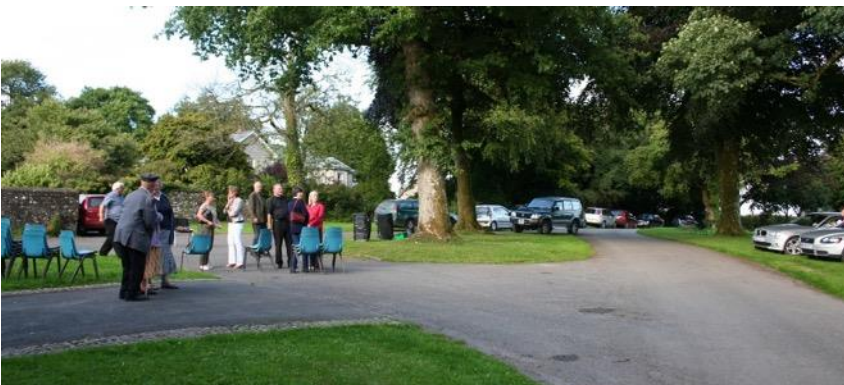
Chatting after a well-attended outdoor service on the Green

We have regular attendance of about ten people (and sometimes more), twice a month, but feel that with our new Vicar, supported by a Team Rector, we can soon increase that number. The church is popular with worshippers from other parishes and the proximity of the excellent village hall and green make it a suitable venue for a variety of services and related events.