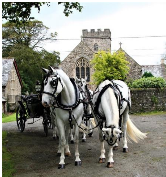
We think it would be hard to find a more lovely wedding venue!

(Please also see: https://www.roseash.info/ )