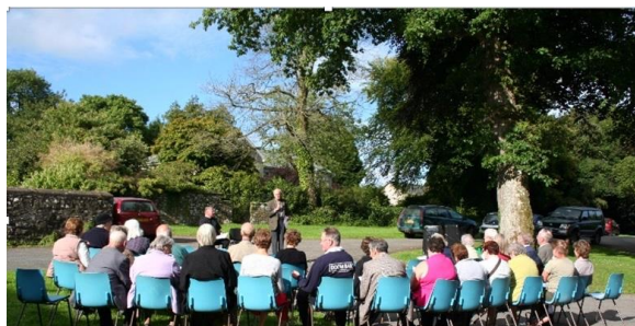
A service on the Village Green, Rose Ash

We are a Benefice of ten Parishes and eleven Churches, spread along the western and southern edge of Exmoor. We are mostly small and wide-spread villages, each with unique characteristics. Although we have many families with young children, our congregations and PCCs are mostly drawn from the older people of each community.