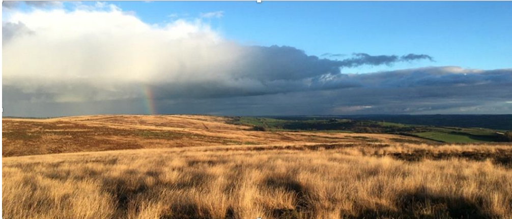
Looking south-east from Exmoor to the heart of Edgemoor-country.

Exmoor is a very special area of rare beauty, recently designated as the North Devon Biosphere, the first of six to be designated in the UK, as part of UNESCO's Man and the Biosphere Programme