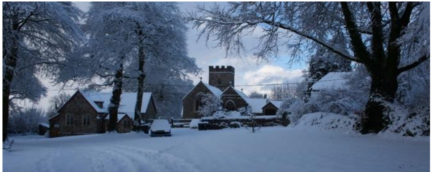
In addition to the church's own listing, all other buildings around the Green have been listed to preserve the unique character of the place.

The church itself is a typical, but substantial building, extensively and carefully restored in the late 19 th century, and refurbished about 20 years ago, but we still have a few structural "challenges" with our stonework. We hope to have the bells restored at some point and would eventually like to upgrade the organ: both improvements would hopefully attract more outside events and involvement in the life of the church.