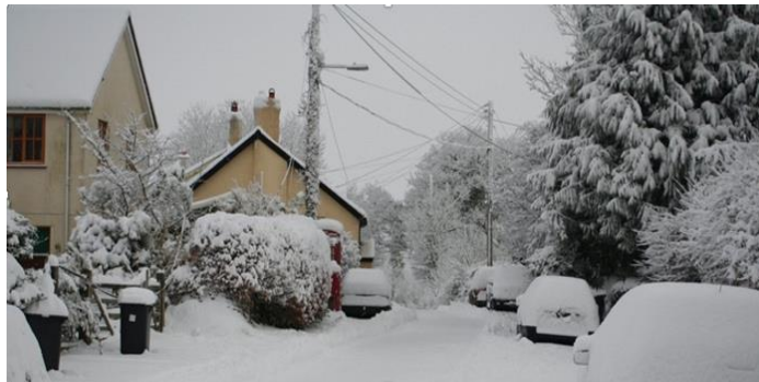
A not untypical winter's scene on the edge of the Moor.

(Oh – and a full driving-licence is an essential for this post, as is a willingness to venture out in all weathers and seasons. A four-wheel drive vehicle would be an asset – though we are willing to give lifts in adverse weather if needed!)