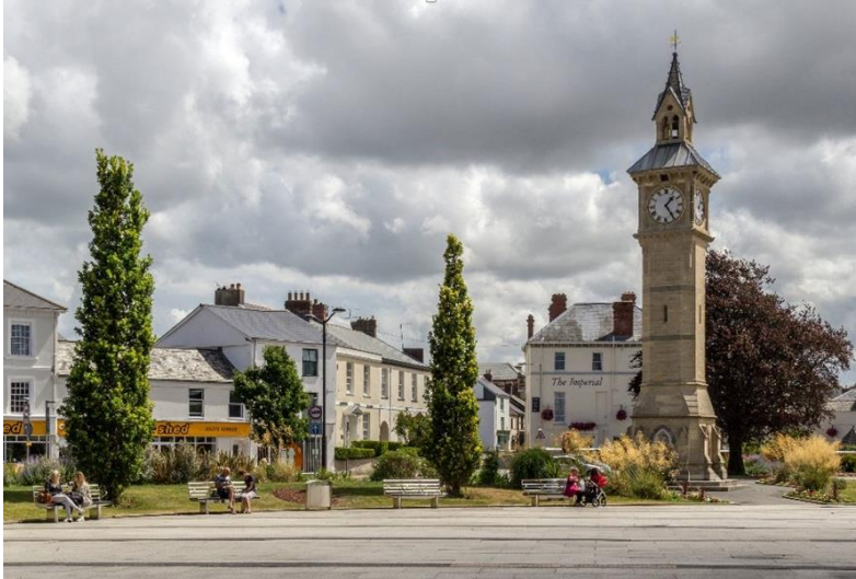
Barnstaple is the main town in the area and has a wide range of shops and services including hospitals and schools etc.

The main towns range in character from the more tourist-oriented areas of the north coast to the inland market towns supporting the mainly rural, farming communities further south. The main supermarket chains have delivery services throughout the region: including Asda, Waitrose, Sainsburys, Tesco and some local shops and greengrocers also deliver.