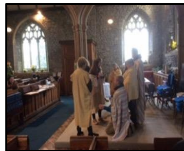
Story telling by Team Tabasco