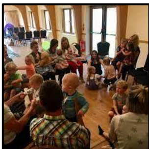
Budding Bishops meeting in the Parish Hall