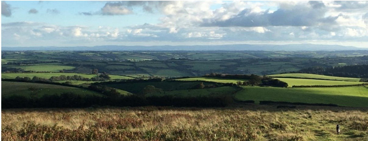
Beautiful rolling fields amongst large areas of moorland are typical of the landscape of the area. In this view from the southern edge of Exmoor looking across Molland Parish, Dartmoor can be seen on the horizon.

The Edgemoor Mission Community consists of ten rural parishes within, or near, the south-western part of Exmoor National Park. All are within easy reach of the A361 North Devon Link Road, the main centre of Barnstaple and the local market town of South Molton. There are good rail and road links to the rest of the country at Tiverton Parkway station and the junction with the M5. There are renowned surfing and bathing beaches, and rocky coves on the North Devon coast, all a short drive away (or perhaps a good bike-ride for the more active).