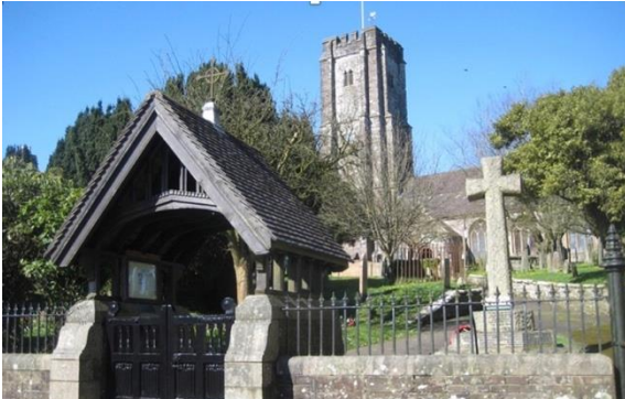
All Saints church, North Molton, is at the administrative heart of the Edgemoor Group.

We can see growing room and need someone with fresh eyes, ideas and enthusiasm to show us the way. We are keen to develop both our own faith and that of others who are not currently part of the Christian community. We are aware that, without this vision, our rural churches will not survive.