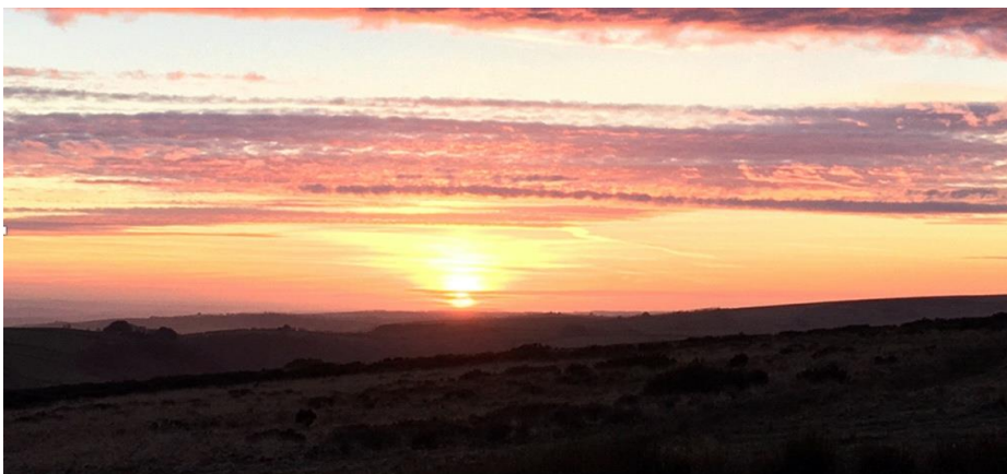
Sunset over the western edge of Exmoor