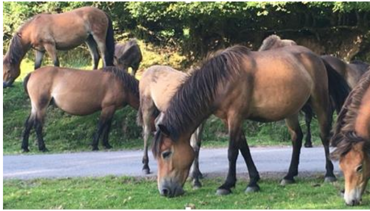
Exmoor Ponies grazing on the southern edge of the moor, a few weeks after the foaling season

As already mentioned, the “Virtual” services have continued, albeit in a slightly different format, and now include a weekly “Local House of Prayer”, and monthly “Evening Meditations”, led by an incredible volunteer lay team. Our previous Vicar set up a weekly, online, combined newsletter and sermon, and this is something that we would like to consider for the future – together with any other such ideas.