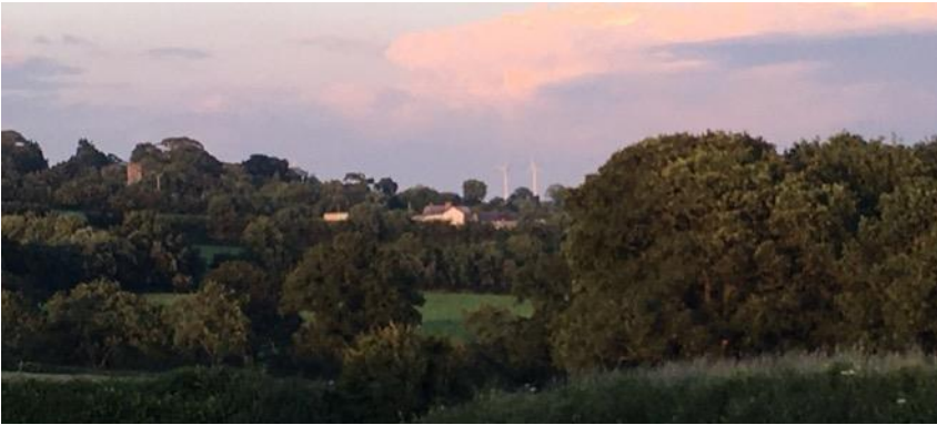
Rose Ash on a quiet summer's evening: the church-tower can be seen higher up on the left.

Rose Ash is a small hamlet sitting on a high ridge, surrounded by outlying farms and houses. The farms are almost entirely devoted to raising cattle and sheep. The air is pure and views are stunning, with many spots having almost 360-degree panoramas stretching from Dartmoor to Exmoor.