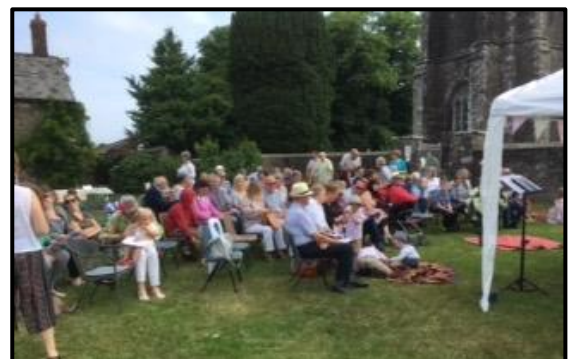
Outdoor service on the Green