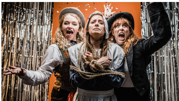
“Hags – a magical extravaganza”

Tuesday 24 th March 11.00- 13.00: Coffee Break